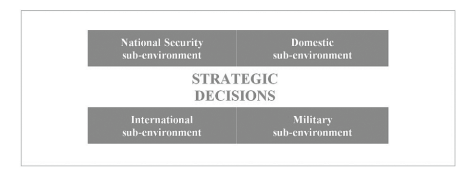
Figure 1 The strategic environment

Within the national sub-environment, for instance, national priorities, opportunities, potential threats and risks along with underlying assumptions must be considered; understanding it is the foundation for grasping the military background, particularly the balance between capabilities (means) and vulnerabilities, and also because military strategy follows directly from national security decisions and pronouncements. For its part, the international sub-environment is the most challenging and unfamiliar of the four: history, culture, geography, politics and foreign security have to be carefully well-thought out, especially the threats that may arise to the balance of power in the environment. All in all, the two greatest influences on strategic decisions come from the domestic and international sub-environments (Guillot, 2003).